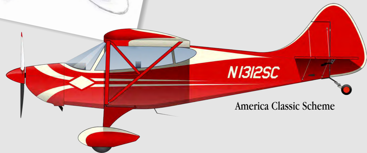
America Classic Scheme